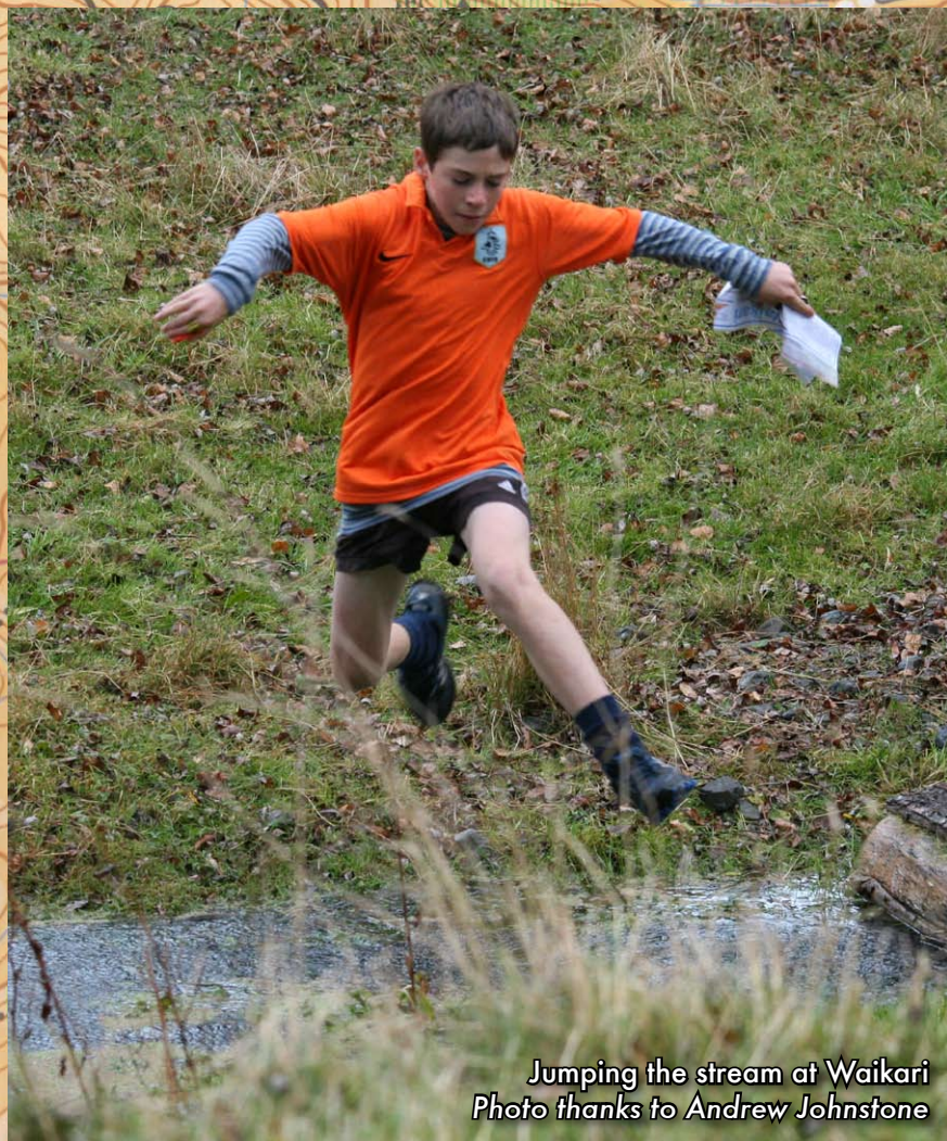
Jumping the stream at Waikari